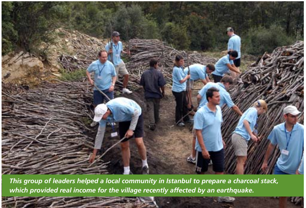
This group of leaders helped a local community in Istanbul to prepare a charcoal stack, which provided real income for the village recently affected by an earthquake.

We are experts in the process of unlocking potential and focusing this in the right ways on the right aims; and we excel at emotionally engaging leaders and teams to own the change, take accountability for it and deliver it. In short ... 'We do the really hard part of the soft stuff.'